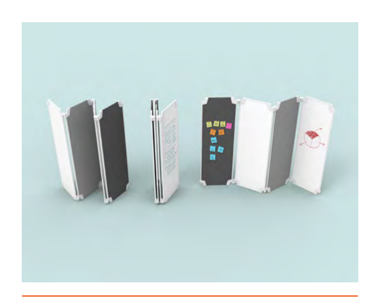
ThoughtWall Storage Capability