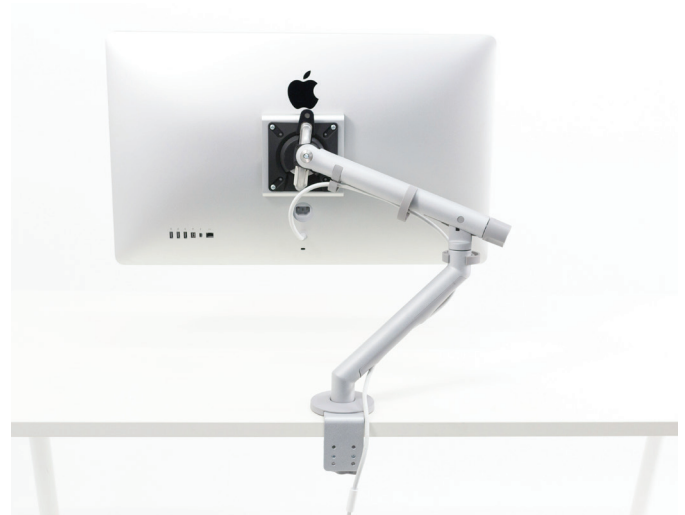
Flo - single arm