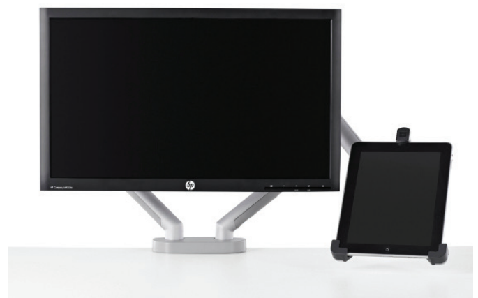
Flo - dual arm with tablet tray