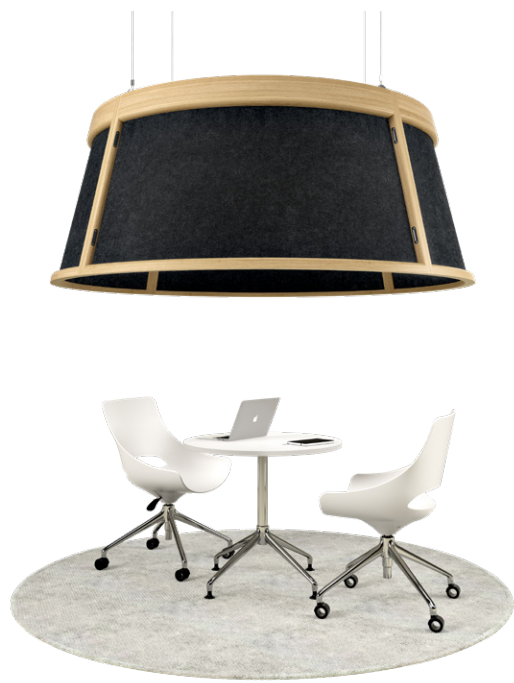
Cone of Silence