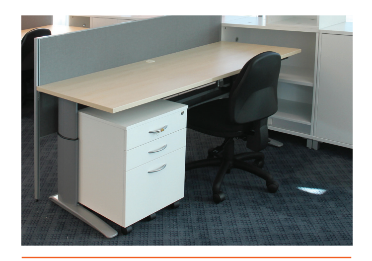
Balance single desk