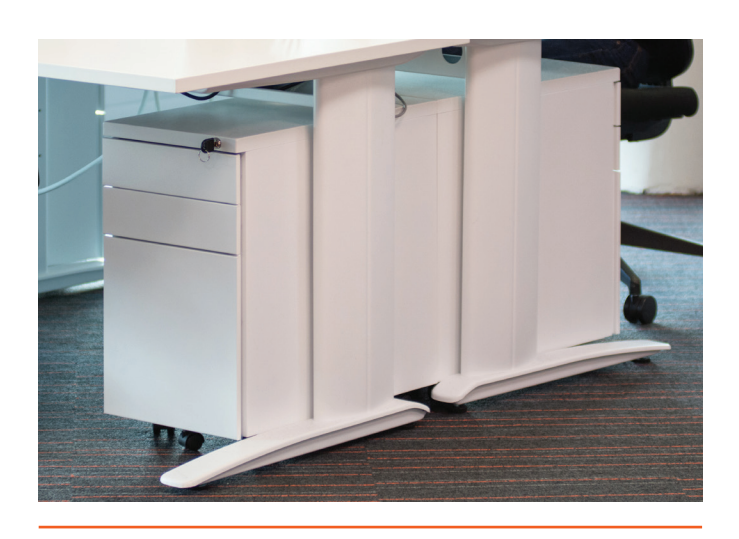
Close up leg detail