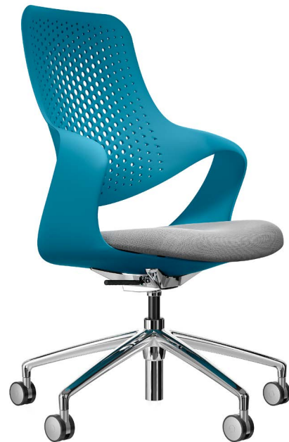
Coza - five star polished base