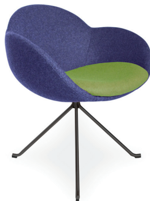
Black powdercoat base