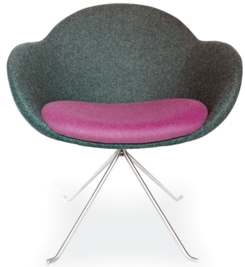
Bloom - brushed stainless steel base