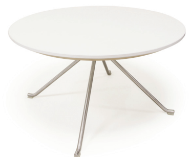
Bloom coffee table